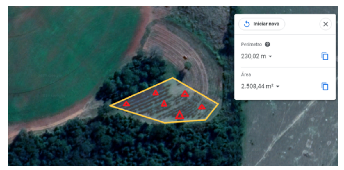
Figure 2 – "Forest-coffee" area, which surrounding vegetation is predominantly closed forest. Six attractive traps for social wasps were randomly distributed in each study area.

The second area (FIGURE 2), "Forest-coffee," belongs to the cultivar Acaiá cerrado. It is also 8 years old, covers 2,508.44 m<sup>2</sup>, and its surrounding vegetation is a fragment of the Atlantic Forest, with large trees that provide shading to part of the coffee trees. The same management system is employed in both areas, with little chemical use.