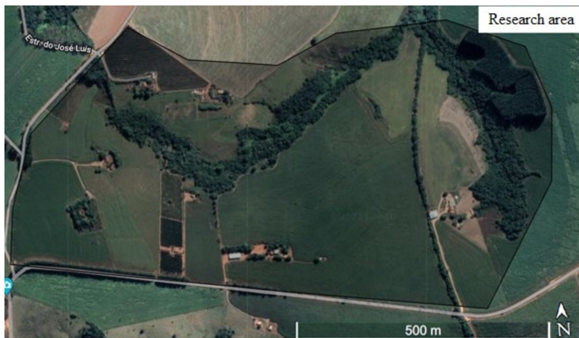
Figure 1 – Location of the agricultural area in the municipality of Medeiros, Minas Gerais, sampled to inventory the fauna of social wasps (Hymenoptera: Polistinae)

The wasps were collected with an entomological net, preserved in 70% alcohol (JACQUES et al. , 2018b). Subsequently, they were identified with entomological keys (RICHARDS, 1978; CARPENTER, 2004) and confirmed by